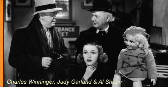
Charles Winninger, Judy Garland & Al Shean