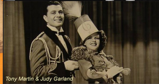
Tony Martin & Judy Garland