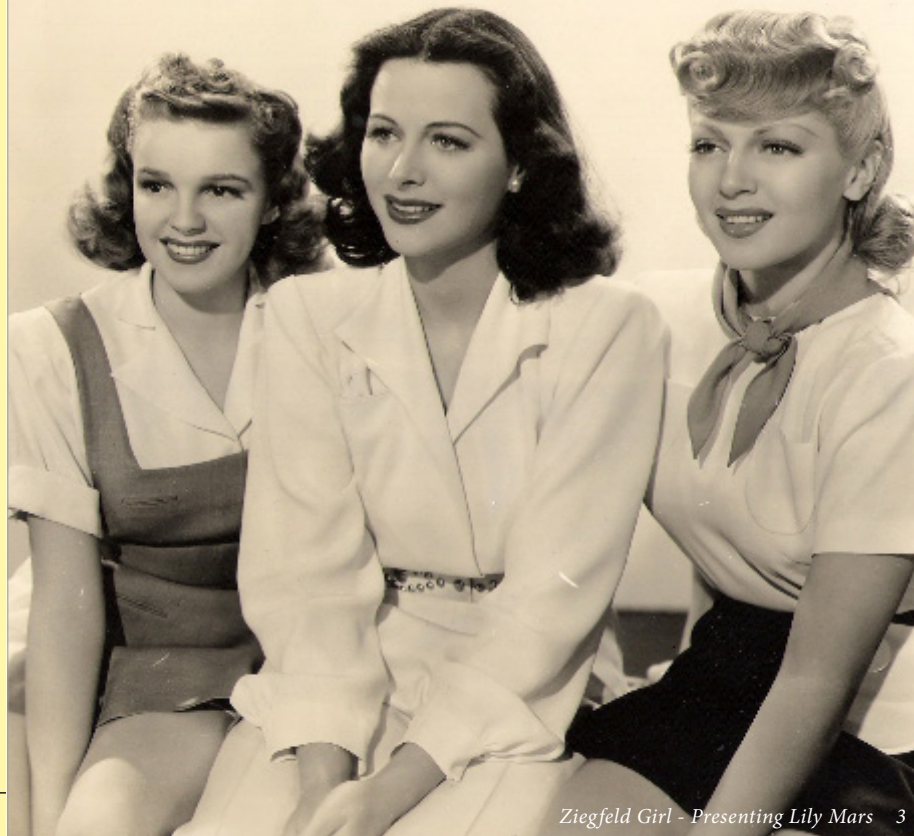
Judy Garland, Hedy Lamarr & Lana Turner in Ziegfeld Girl

Not all of the pre-recordings survive for both Ziegfeld Girl and Presenting Lily Mars, but luckily most do. This gives us the chance to flesh out the missing tracks by using a variety of sources including the soundtracks to the films themselves and radio promotional records. Due to the fact that MGM recorded their music in an early form of multi-track recording, what they termed “stems,” many recordings can now be presented in true stereo. In some instances, not all of the stems survive. In other instances, the stems survive for only some sections of the recordings. We have used all of these sources to provide the best possible presentation of these classic soundtracks. We hope you enjoy them as much as we do!