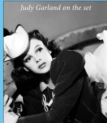
Judy Garland on the set

Deleted Finale Reprise (Takes 1 & 2) (Tony Martin & Judy Garland) (1:18)