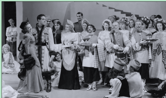
Above: Marta Eggerth, Judy Garland & Cast

Finale (Film Version) * (Judy Garland, Charles Walters & The MGM Studio Chorus) (6:28)