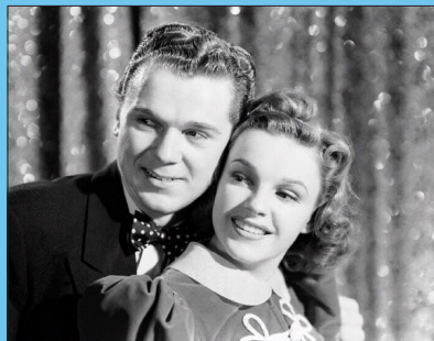
Above: Jackie Cooper and Judy Garland Below: Judy Garland, Lana Turner and James Stewart Far Right: Judy Garland & Chorines