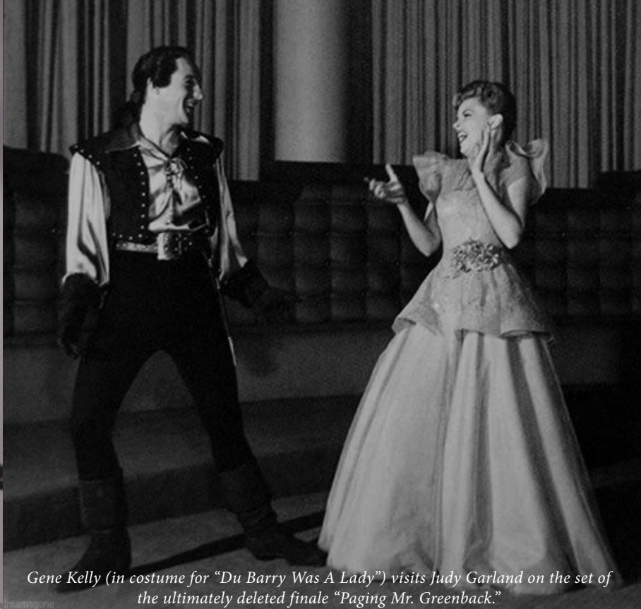
Gene Kelly (in costume for "Du Barry Was A Lady") visits Judy Garland on the set of the ultimately deleted finale "Paging Mr. Greenback."