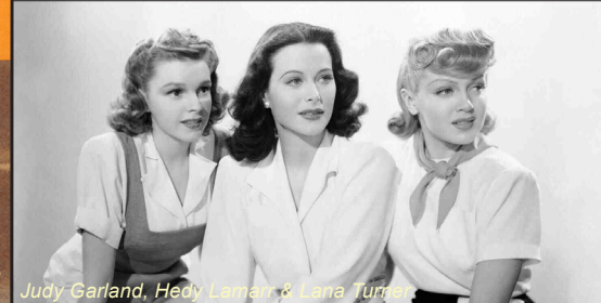
Judy Garland, Hedy Lamarr & Lana Turner