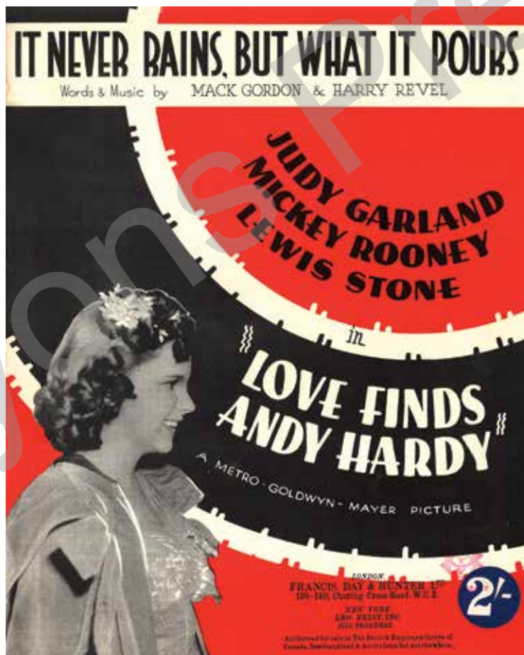
British sheet music for "It Never Rains, But What It Pours" from Love Finds Andy Hardy (1938). From the author's collection.

Garland's work on Listen, Darling was in its last weeks when she began costume tests and prerecording sessions for The Wizard of Oz . Over the next year, most of her time was spent either working on Oz or with Oz -related duties, as well as completing another film, Babes in Arms (1939). It took MGM less than four years to make Judy Garland a star.