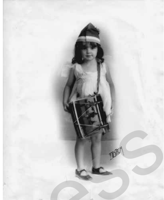
Baby Gumm (Judy Garland), 1925.

The stage debut of Baby Frances Gumm became the first of many legends in Garland's life story. Almost immediately after Garland signed with MGM eleven years later, the studio's publicity department began to spin many fabricated stories about this event and others, which usually were barely rooted in truth. But at the time, no one in the general public would have known. That Friday after her debut, Frances had her first newspaper mention. The Grand Rapids Independent , in their notice for the Christmas Day and post-Christmas Day billing for the Grand, noted, "Added attraction for Friday eve-