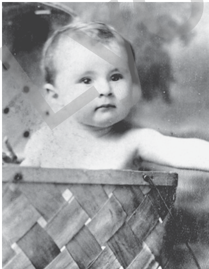
Baby Gumm (Judy Garland) circa 1922. From the author's collection.

T o understand Judy Garland's life and career at MGM, one must understand her life and career before MGM. Understanding Garland's formative vaudeville years helps us understand the choices she made, the choices others around her made, and why things happened the way they did. If anyone was "born in a trunk," it would be—at least euphemistically—Judy Garland.