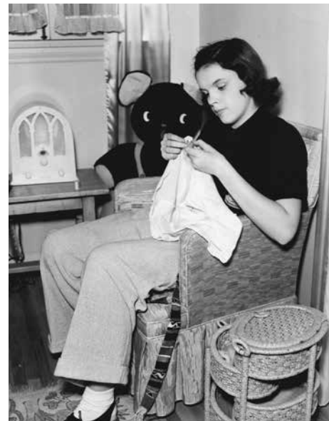
MGM promotional photo of Garland at home.

Another day at the MGM photo studios, August 6, 1937. From the author's collection.