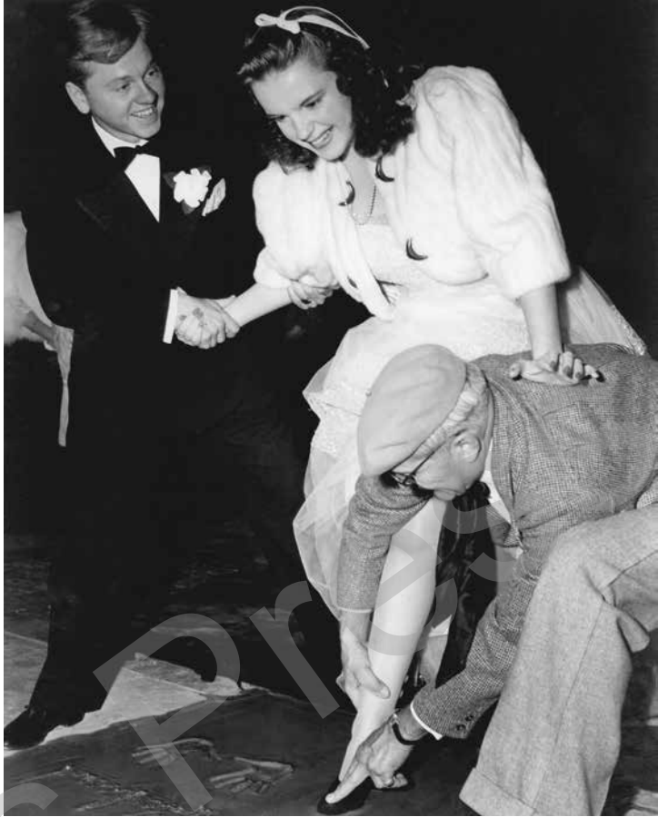
Garland puts her hand and footprints in the forecourt of Grauman's Chinese Theatre on October 10, 1939, assisted by Mickey Rooney and a Grauman's staff member.

Babes in Arms had its world premiere at Grauman's Chinese Theatre in Hollywood on October 10, 1939. The star-studded event was highlighted by Garland placing her hand and footprints in cement in the forecourt. She was the seventy-fourth star to receive this honor. As if anyone needed proof, this was the sign that she was now a true movie star. The film was a hit