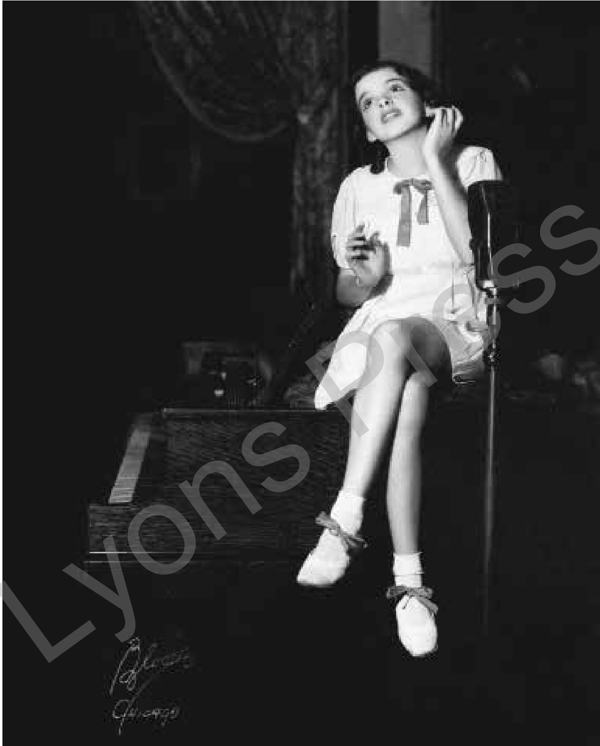
Garland poses in the same manner that she sang “Bill” on stage in dozens of shows (Chicago, 1934).