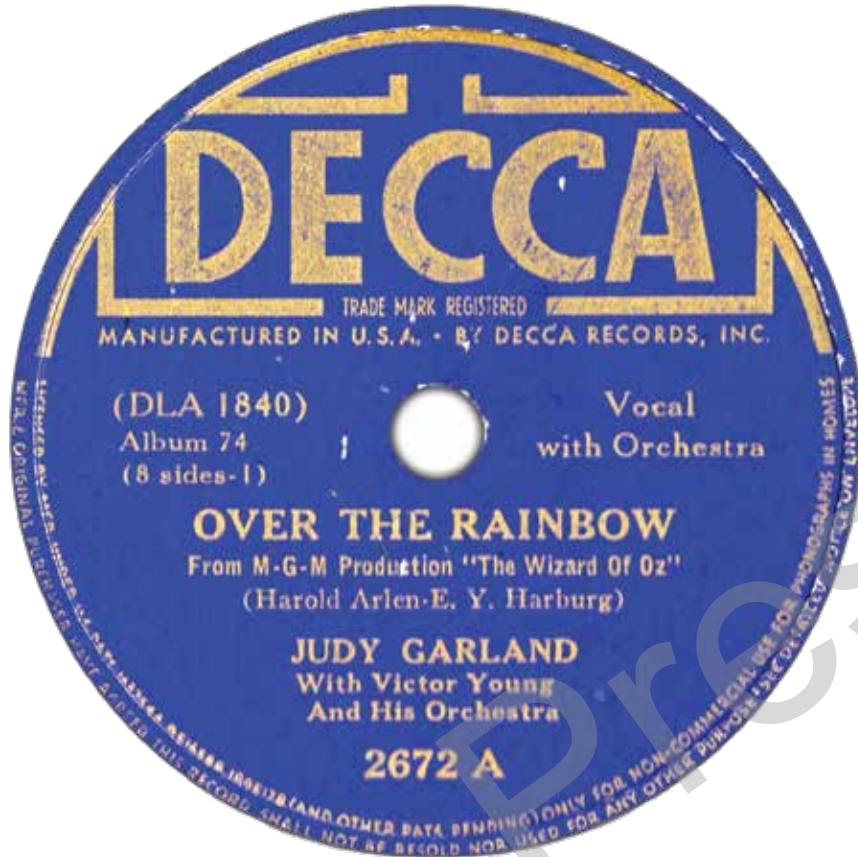
Label of the Decca Records 78-rpm-release of “Over the Rainbow” from the 1940 album of songs from the film.