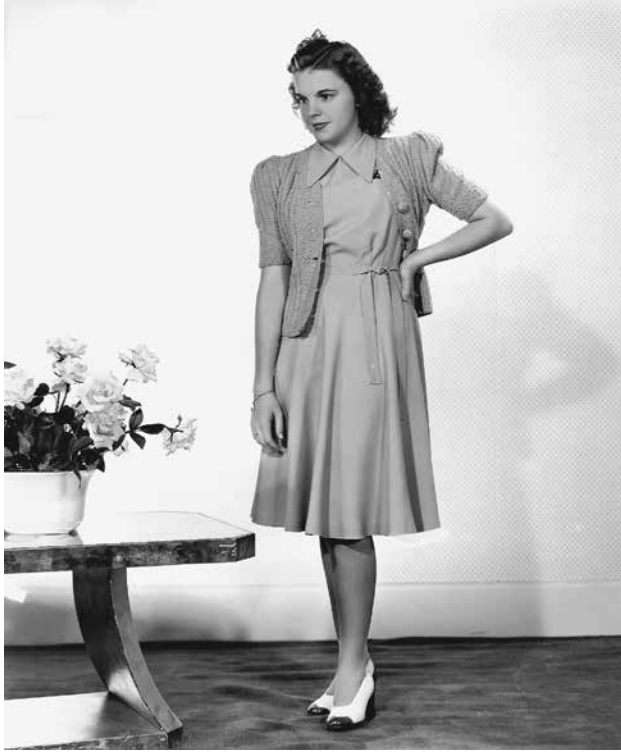
MGM promotional picture, 1939.

chatting with New York's Mayor LaGuardia.