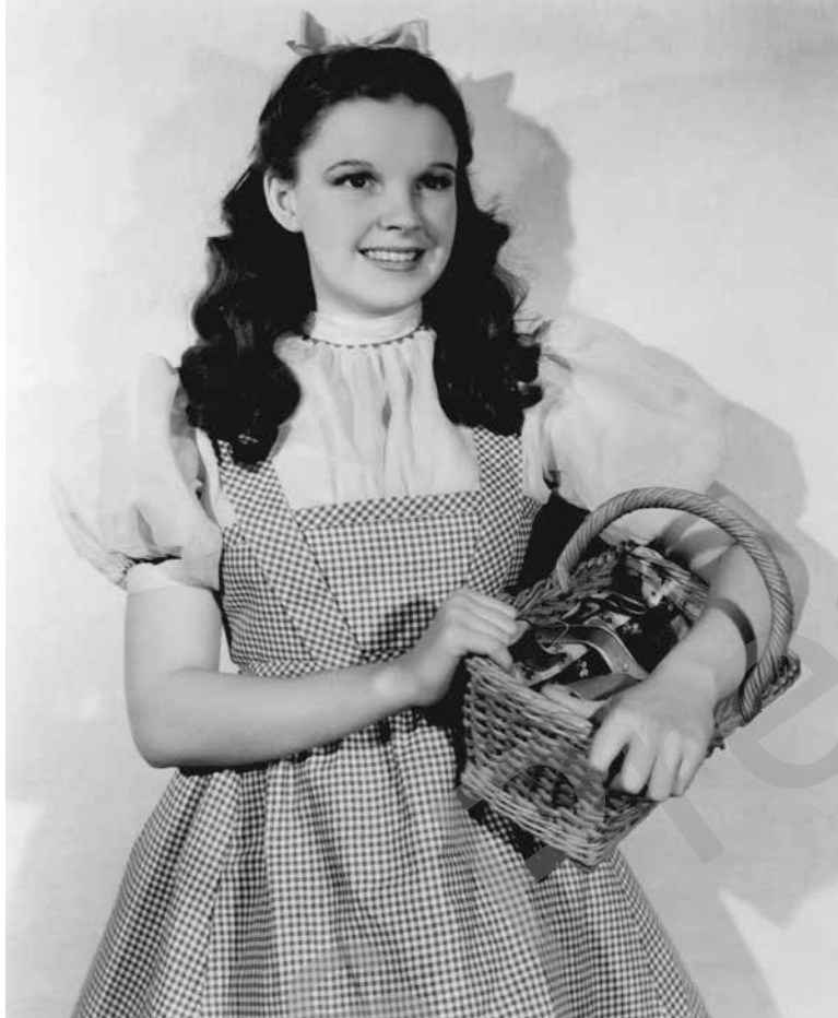
Garland posed for portraits for The Wizard of Oz (1939), February 25, 1939.

plot points), and once the songs were written and (most of) the cast was in place (having endured many costume, hair, and makeup tests), it was time for the first prerecording session on September 30, 1938. According to the surviving Daily Music Report , Garland, Ray Bolger (the Scarecrow), Buddy Ebsen (the Tin Man), and Bert Lahr (the Cowardly Lion) prerecorded “If I Only Had a Brain,” “If I Only Had a Heart,” “If I Only Had the Nerve,” and “Wonderful Wizard of Oz” (“We’re Off to See the Wizard”) (the duo, trio, and quartet versions). Garland prerecorded “Over the Rainbow” on October 7, 1938. Six takes were printed (that is, kept for audio mixing), takes 1, 2, 4, 6, 7, and 8. The version heard in the film was edited together by taking the first verse of Take 5 and joining it to the bulk of Take 6.