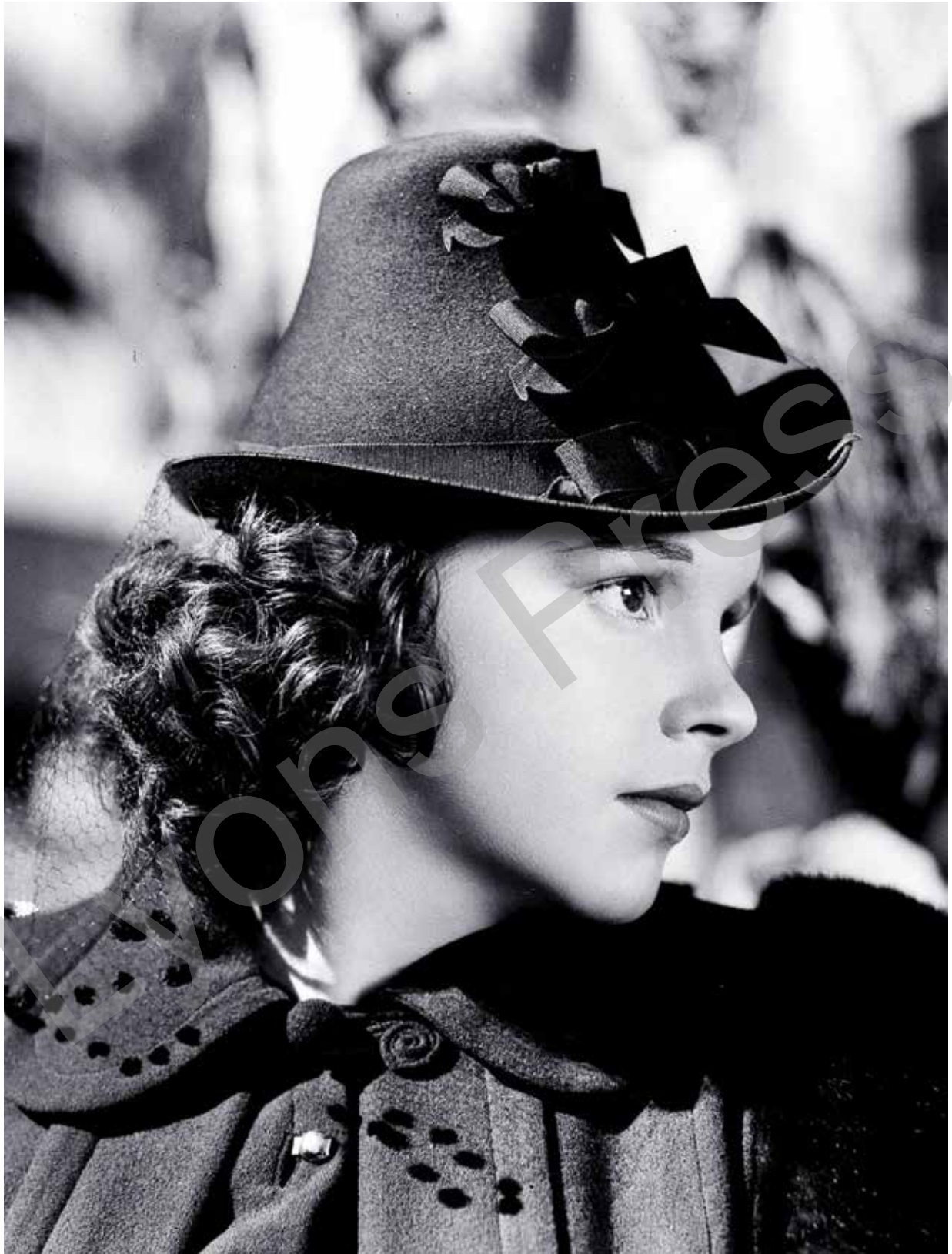
MGM studio portrait used to promote Listen, Darling (1938). The suggested studio text accompanying the photo reads, "Brown, Grosgrain Bows, and a back veil, are youthfully charming on this high-crowned, roll-brim brown felt hat chosen for fall by Judy Garland, appearing in Metro-Goldwyn-Mayer's 'Listen, Darling.'"