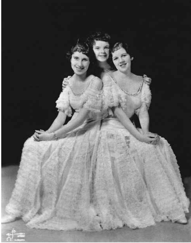
The Gumm Sisters in 1931.