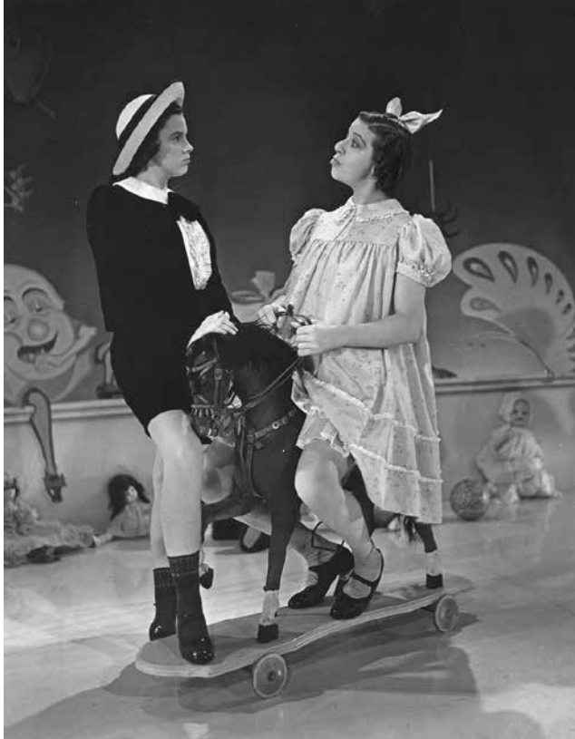
Garland and Fanny Brice perform "Why? Because!" in Everybody Sing (1938). From the author's collection.

Sheridan Theatre on January 24, 1938. This was the beginning of what became Garland's first major film promotional tour. The amount of attention given to Garland and Everybody Sing by local MGM executives and theatre owners/managers is reflected in this blurb in Variety about the events surrounding the train's short stop in Houston, Texas, while en route to Miami: