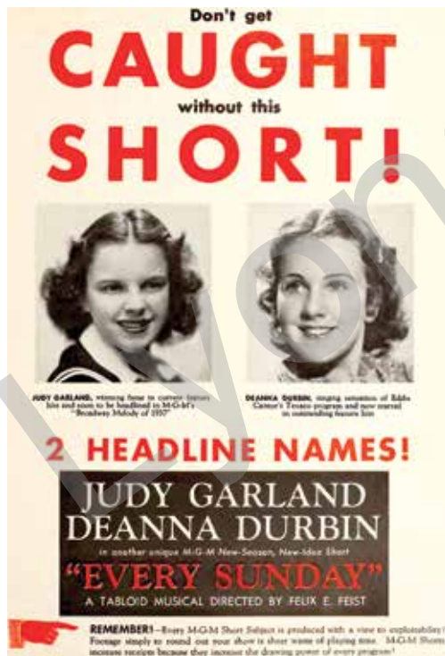
Trade advertisement for Every Sunday from the Motion Picture Herald , December 19, 1936.

The basis of these stories is the popular image of Garland as the unattractive one that glamorous MGM was stuck with after the prettier Durbin was mistakenly let go. This perspective