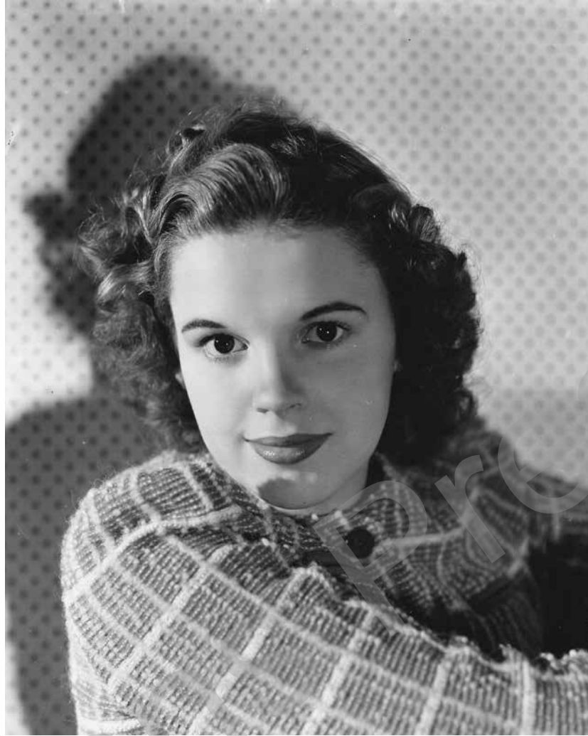
MGM promotional portrait, 1939. From the author's collection.

and eclipsed Oz at the box office and in initial popularity. It spawned a series of Garland/Rooney "Let's Put on a Show!" musicals, all produced by Freed, that lasted as late as 1943's Girl Crazy (the last of the series). Rooney even received an Oscar nomination for Best Actor. Garland was relegated to the honorary award category as the recipient of a "juvenile" miniature Oscar for her work in 1939 in The Wizard of Oz and Babes in Arms . She was also one of only two women to make the top ten box office list, the other being Bette Davis.