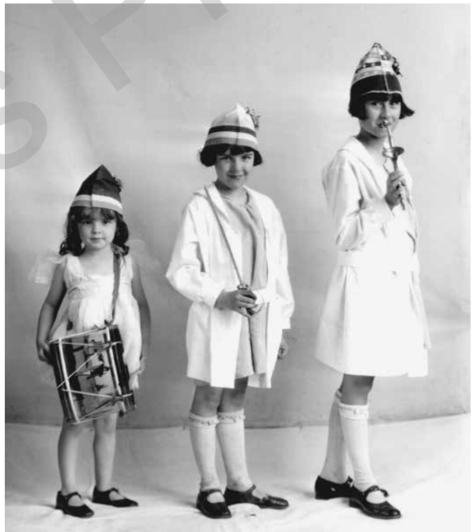
The Gumm Sisters, 1925.