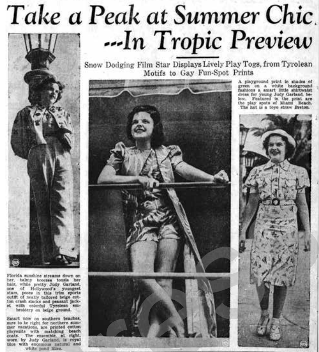
Typical MGM promotion of Garland in the latest teen fashions, February 28, 1938. From the author's collection.

After the success in New York, the Everybody Sing tour moved on to engagements in Providence, Rhode Island (February 18 through 24), and Pittsburgh, Pennsylvania (February 25 through March 3), where Garland was given membership in the local “Sekatory Hawkins Club.”