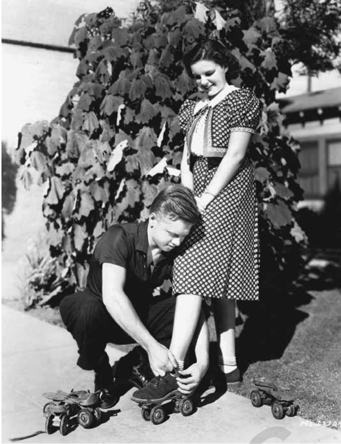
Two typical American teens, Mickey Rooney and Garland, go roller skating, 1937.