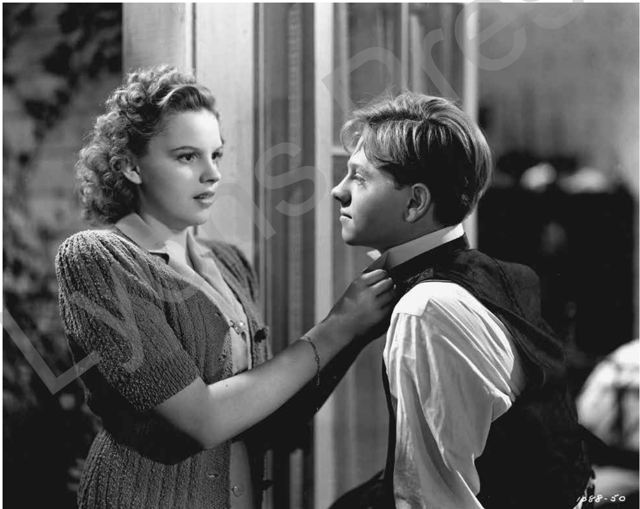
"Where or When"—Garland and Mickey Rooney in Babes in Arms (1939).