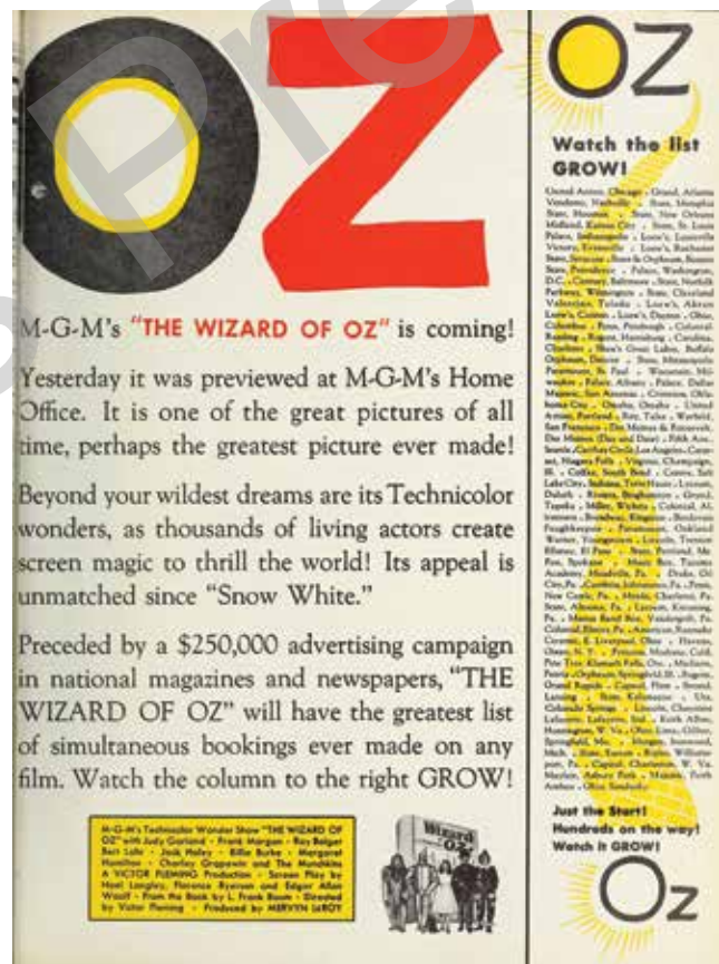
MGM trade ad as published in the Film Daily magazine on August 2, 1939.

Director Victor Fleming won the Best Director Oscar for Gone with the Wind . If he hadn't been nominated for that film, he might have been nominated for The Wizard of Oz . The year 1939 was incredible for the movies, considered by most the best year for classic films, topped off by the mega-hit Gone with the