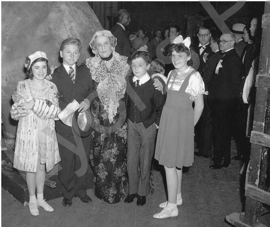
Garland ( far right) is seen with Edith Fellows, Mickey Rooney, May Robson, and Freddie Bartholomew at the Will Rogers Memorial Fund "Show of Shows" at the Shrine Auditorium in Los Angeles, California, December 1, 1935.

On December 18, Variety published a short blurb (dated December 17) that MGM was