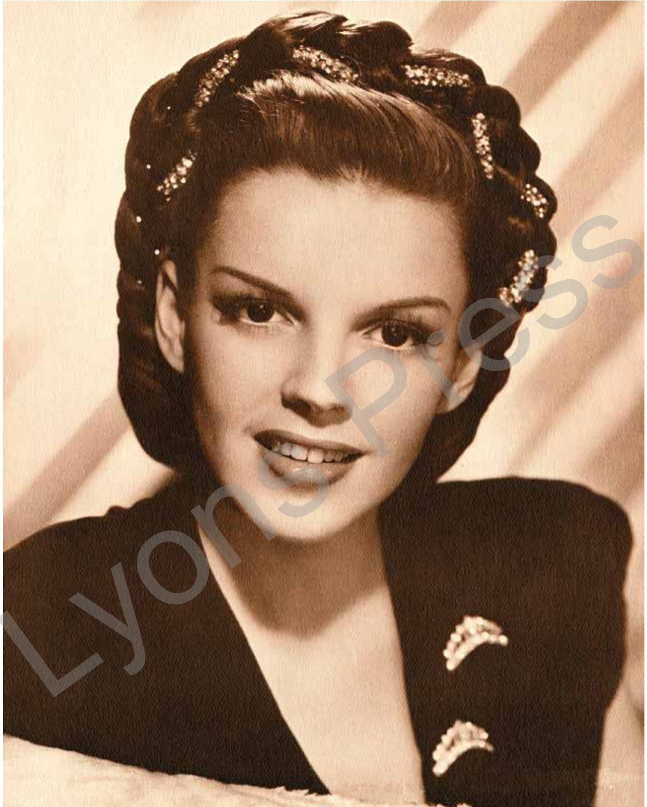
Judy Garland, "The Voice of MGM," 1943 promotional photo.