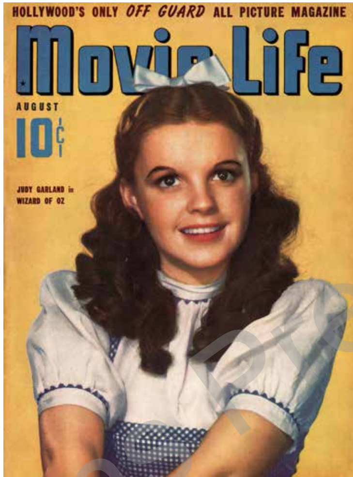
Garland as Dorothy makes a lovely cover for the August 1939 issue of the fan magazine Movie Life . From the author's collection.

featured film was the MGM version of Mark Twain's The Adventures of Huckleberry Finn , starring "America's Favorite Boy!" Mickey Rooney. 14 Incidentally, that was the film that director Norman Taurog left The Wizard of Oz to direct. Taurog was the original director of Oz (before Richard Thorpe) but left the project before any shooting began, knowing he wasn't the right director for it.