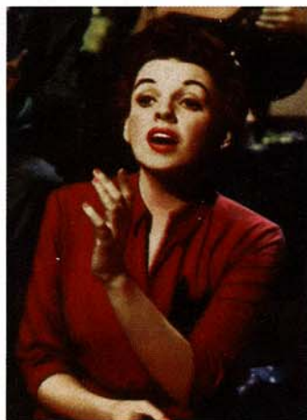
Judy Garland is the centerpiece of the 1954 version of the Warner Bros. classic.

Digital film restoration is most commonly accomplished at 2K, though an increasing number have been using 4K. A 4K file contains four times as much picture information — measured in pixels — as a 2K file, and 6K contains 2¼